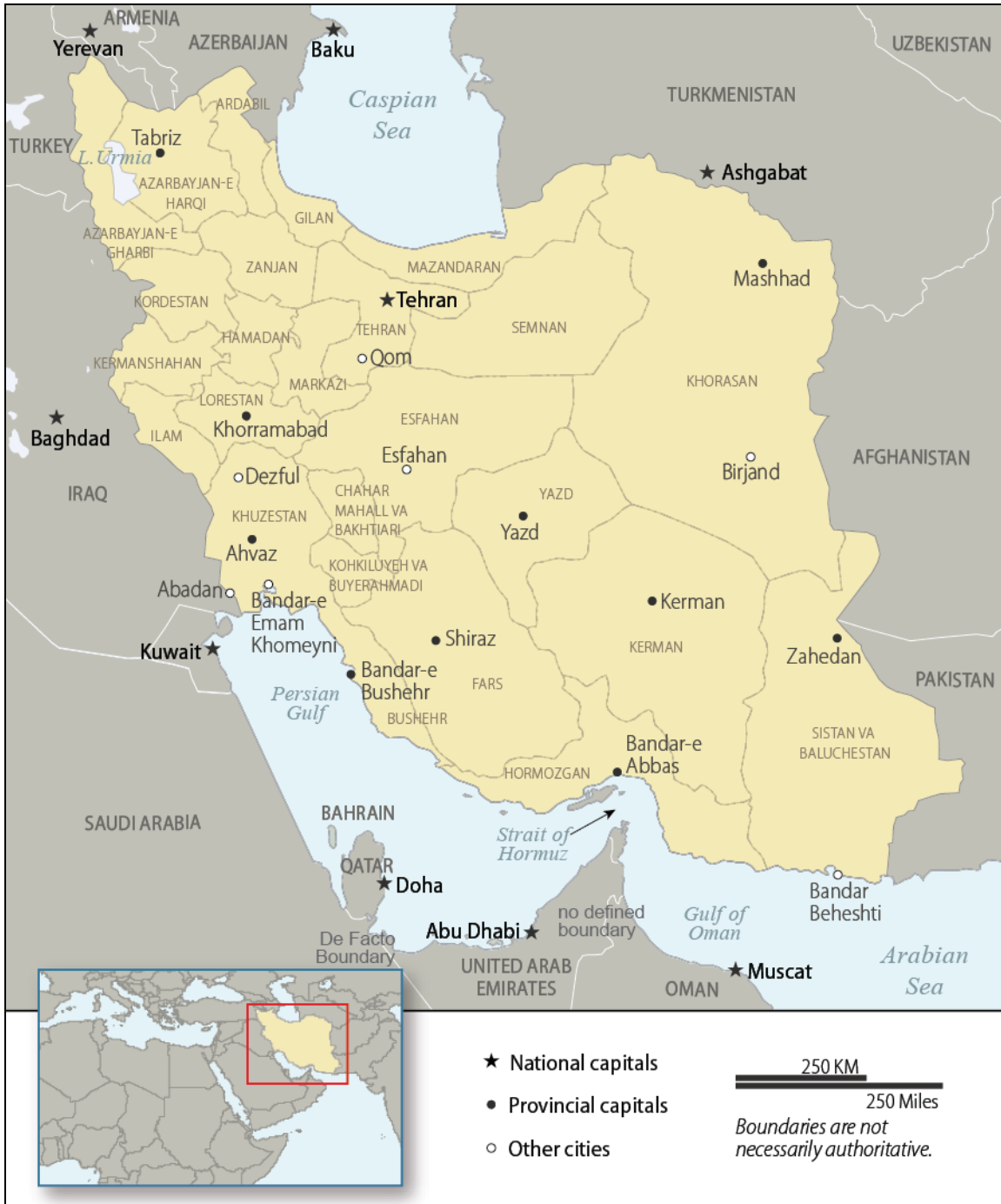
Figure 2. Map of Iran