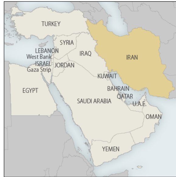
Figure 1. Map of Near East

Iran has a 1,100-mile coastline on the Persian Gulf and Gulf of Oman, and intimidating and influencing the Persian Gulf monarchy states have always been a key focus of Iran’s foreign policy—even during the reign of the Shah of Iran. In 1981, perceiving a threat from revolutionary Iran and spillover from the Iran-Iraq War that began in September 1980, the six Gulf states formed the Gulf Cooperation Council alliance (GCC: Saudi Arabia, Kuwait, Bahrain, Qatar, Oman, and the United Arab Emirates). U.S.-GCC security cooperation, developed during the 1980-1988 Iran-Iraq War, expanded significantly after the 1990 Iraqi invasion of Kuwait. Prior to 2003 the extensive U.S. presence in the Gulf was also intended to contain Saddam Hussein’s Iraq, but, with Iraq militarily weak since the fall of Saddam Hussein, the U.S. military presence in the Gulf focuses on containing Iran and conducting operations against regional terrorist groups. The GCC states host significant numbers of U.S. forces at their military facilities and procure sophisticated U.S. military equipment.