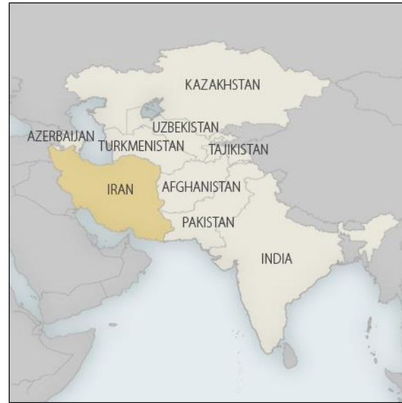
Figure 3. South and Central Asia Region

Most of the Central Asia states that were part of the Soviet Union are governed by authoritarian leaders. Afghanistan remains politically weak, and Iran is able to exert influence there. Some countries in the region, particularly India, seek greater integration with the United States and other world powers and tend to downplay cooperation with Iran. The following sections address countries that have significant economic and political relationships with Iran.