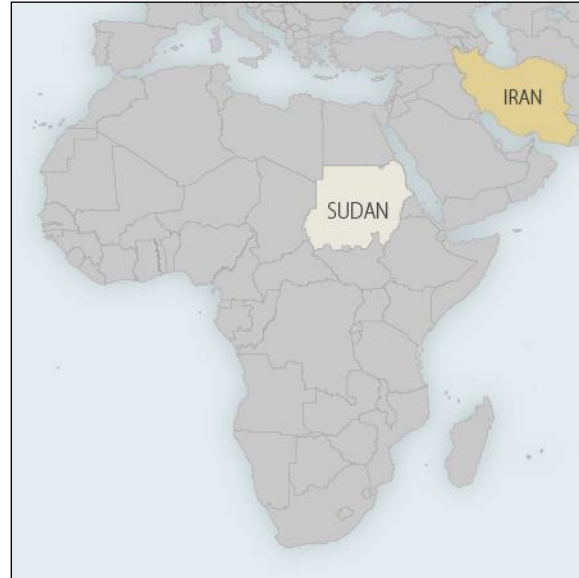
Figure 5. Sudan

Rouhani has made few statements on relations with countries in Africa and has apparently not made the continent a priority. Tehran appears, however, to retain an interest in cultivating African countries as trading partners—an interest that might increase now that the Trump Administration has decided to exit the JCPOA and reimpose all U.S. sanctions. Iran's leaders also apparently see Africa as a market for its arms exports and as sources of diplomatic support in U.N. forums. 175 African populations may also be seen as potential targets for Iranian "soft power" and religious influence. Iran's Al Mustafa University, which promotes Iran's message and Shiite religious orientation with branches worldwide, has numerous branches in various African countries. 176